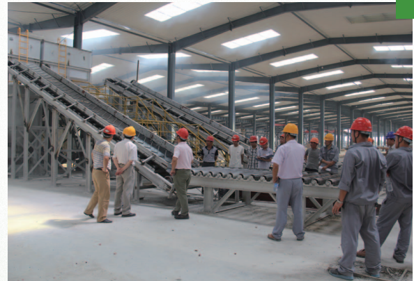
The new building materials project in Bozhou is undergoing individual equipment trial tests