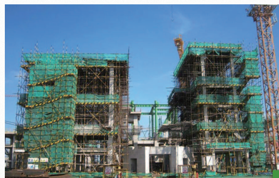
The raw material millstone for the Thailand SCG cement project built by the Group in Indonesia