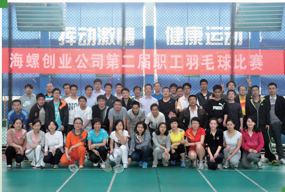
The Company organised various leisure activities for employees

Since the listing of the Group, no share option had been granted under the Share Option Scheme.