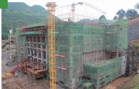
Waste incineration project in Zunyi under construction