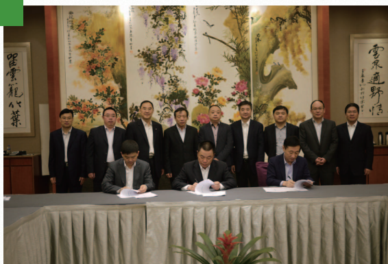
China National Building Material Group Corporation and the Group entered into a strategic cooperation agreement for the waste disposal project

In order to support the healthy and sustainable development of the Group, the Group strengthened its cooperation with China National Building Material Group Corporation by entering into a strategic cooperation agreement for the cooperation in waste incineration projects with its technological strength in waste incineration projects and the nation-wide cement production lines of China National Building Material Group Corporation. Besides, the Group also entered into a strategic cooperation agreement with New World Environmental Services Group in respect of the disposal project of solid waste by cement kilns and such project will be first constructed in Qian County, Shaanxi Province.