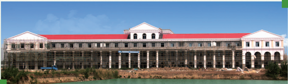
The office building for the new building materials project in Bozhou under construction