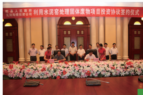
The People's Government of Qian County, Shaanxi Province and the Group entered into an investment agreement for the disposal project of solid waste by cement kilns

During the Reporting Period, the Group facilitated the development of energy-preservation and environmental-protection industries and accelerated the construction progress of new building materials projects in Bozhou and Wuhu. The two projects are expected to commence operation in September and December of 2014, respectively. While ensuring the project progress, the Group also carried out various preparatory works such as formulating marketing strategies, recruiting staff and training employees.