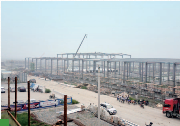
New building materials project in Wuhu under construction

Looking forward, the Group is determined to capture new development opportunities and overcome challenges. The Group will consolidate its achievements in energy-saving industry to boost the steady growth of environmental-protection industry. In addition, the Group will proactively carry out preparatory works before the new building materials projects in Wuhu and Bozhou commence operation. Subsequent to the commencement of operation, the annual production capacity of cellulose cement autoclaved boards of the Group will reach 32.0 million square meters, making the Group the largest producer and supplier of cellulose cement autoclaved boards in China and generating additional revenue for the Group. New projects in other regions of China will be deployed in line with sales conditions in the market. The Group will selectively seek opportunities of merger and acquisition and explore new businesses while developing its principal businesses, with an aim to expand to the international market, develop into a world-class enterprise and achieve better financial results for its shareholders.